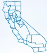
LOCAL AIR DISTRICTS