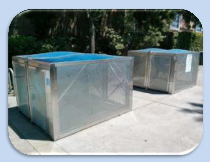
Electronic Bicycle Locker Program Website:

http://www.baaqmd.gov/grant-funding/public-agencies/bike-racksand-lockers